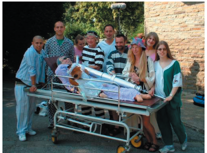
Activists in England at last year's Bed Push

Sunday, July 29 -- 2pm Cooley Dickinson Hospital Northampton Followed by a Street Parade to First Churches for a Speak Out Against Abuse in the Local System Join us!